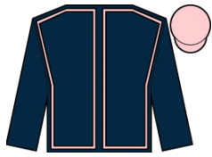
SIR HENRY COTTON